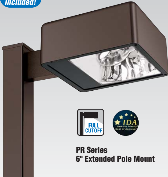
PR Series 6" Extended Pole Mount